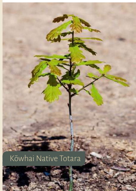
Kōwhai Native Totara

To assist with a reference to the plot in the future, the natural burial plot will be assigned a GPS coordinate by the Dunedin City Council.