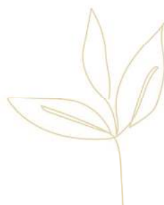
First Church of Otago

A Catering Lounge for a 'cup of tea' and gathering is seen as an important feature when selecting a venue. Our Funeral Directors will be happy to discuss suitable options for you to consider.